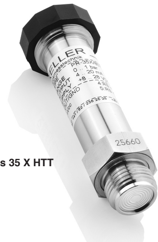
Series 35 X HTT