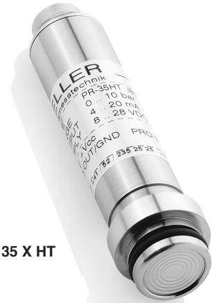
Series 35 X HT

With the KELLER software READ30 and PROG 30, a RS485 converter (i.e. K-102, K-104 or K-107 from KELLER) and a PC, the pressure can be displayed, the units changed, a new gain or zero set. The analog output can be set to any range within the compensated range.